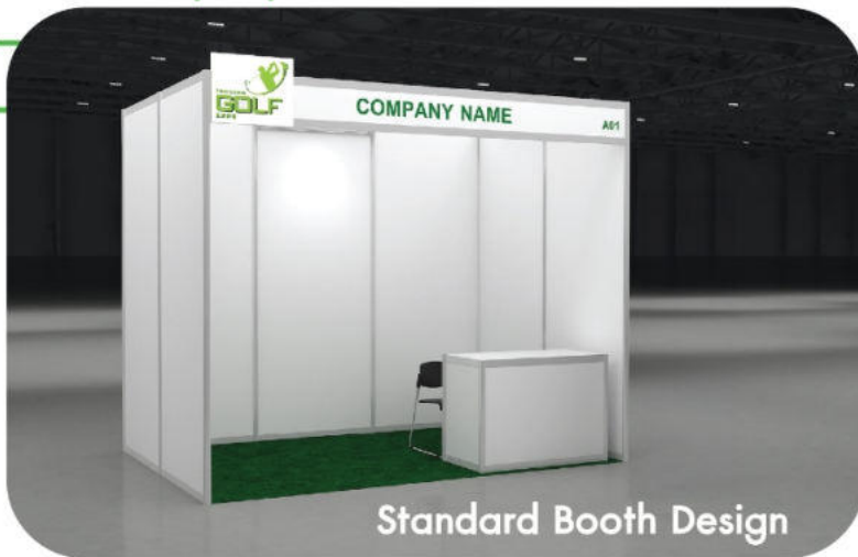
Standard Booth Design

(This graphic illustration draft is subject to change without prior notice.)